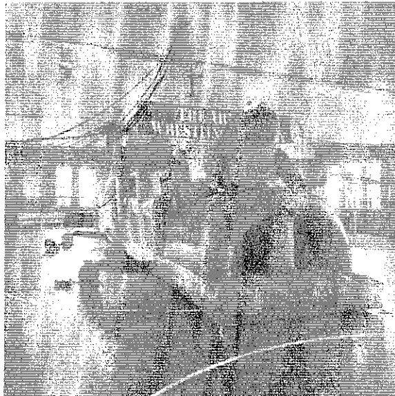
Tropical Obstacle - $450 Double lane obstacle course.

12. Discussion of having Human Relations signs placed around the Town Park/ BART.