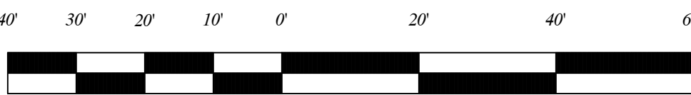
GRAPHIC SCALE SCALE: 1 INCH = 20 FEET