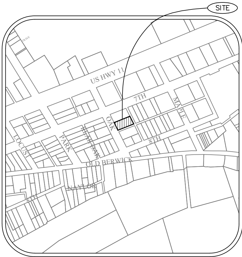
LOCATION / VICINITY MAP SCALE: 1 INCH = 500 FEET