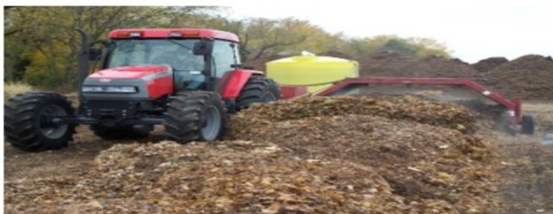
The operator is turning the collected leaves periodically throughout the year

Anyone interested in large volumes of the finished mulch can coordinate with the Public Works Director for assistance with loading.