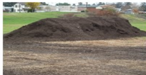
Finished screened compost ready for pickup