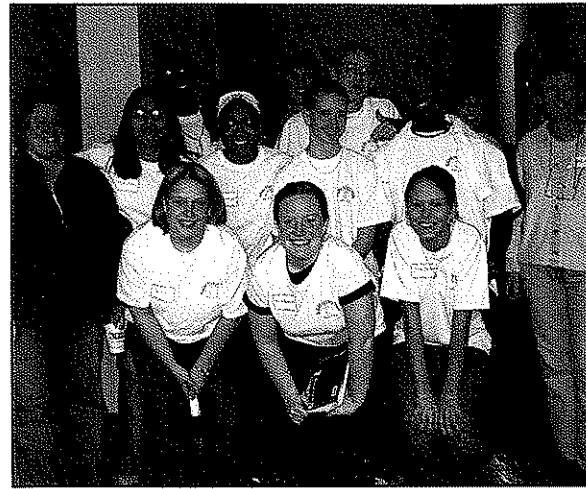
Berwick High School Making Connections Group