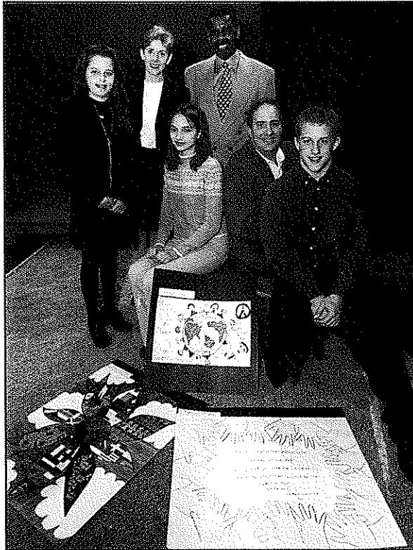
Dr. Martin Luther King, Jr. poster contest winners