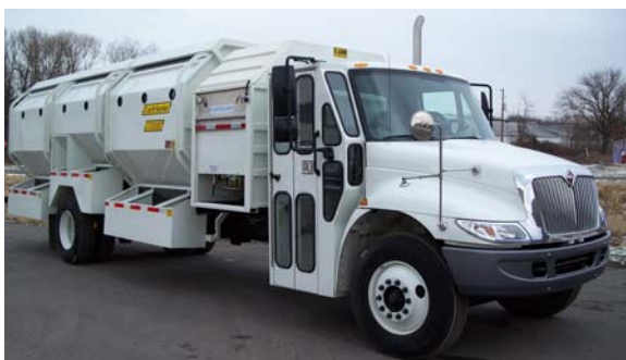
Pictured above KANN curbside sorter truck which allows for the collection of separated curbside collection. At right new Loadmaster cardboard collection vehicle.

Please note that only corrugated cardboard should be set out for collection. Cereal, gift and tissue boxes are recyclable at the Recycling Center in the Mixed Paper Bin but should not be placed at the curb.