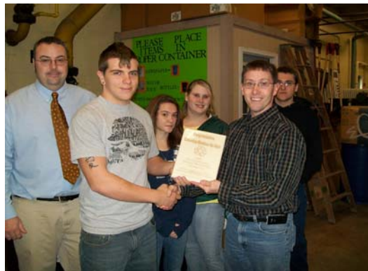
A recycled content Award Plaque was presented to Columbia– Montour Vo-Tech as the winner of the 2009 Competition.

Should you have any questions please feel free to contact me at 784-4532 or email cfritz@bloomsburgpa.org .